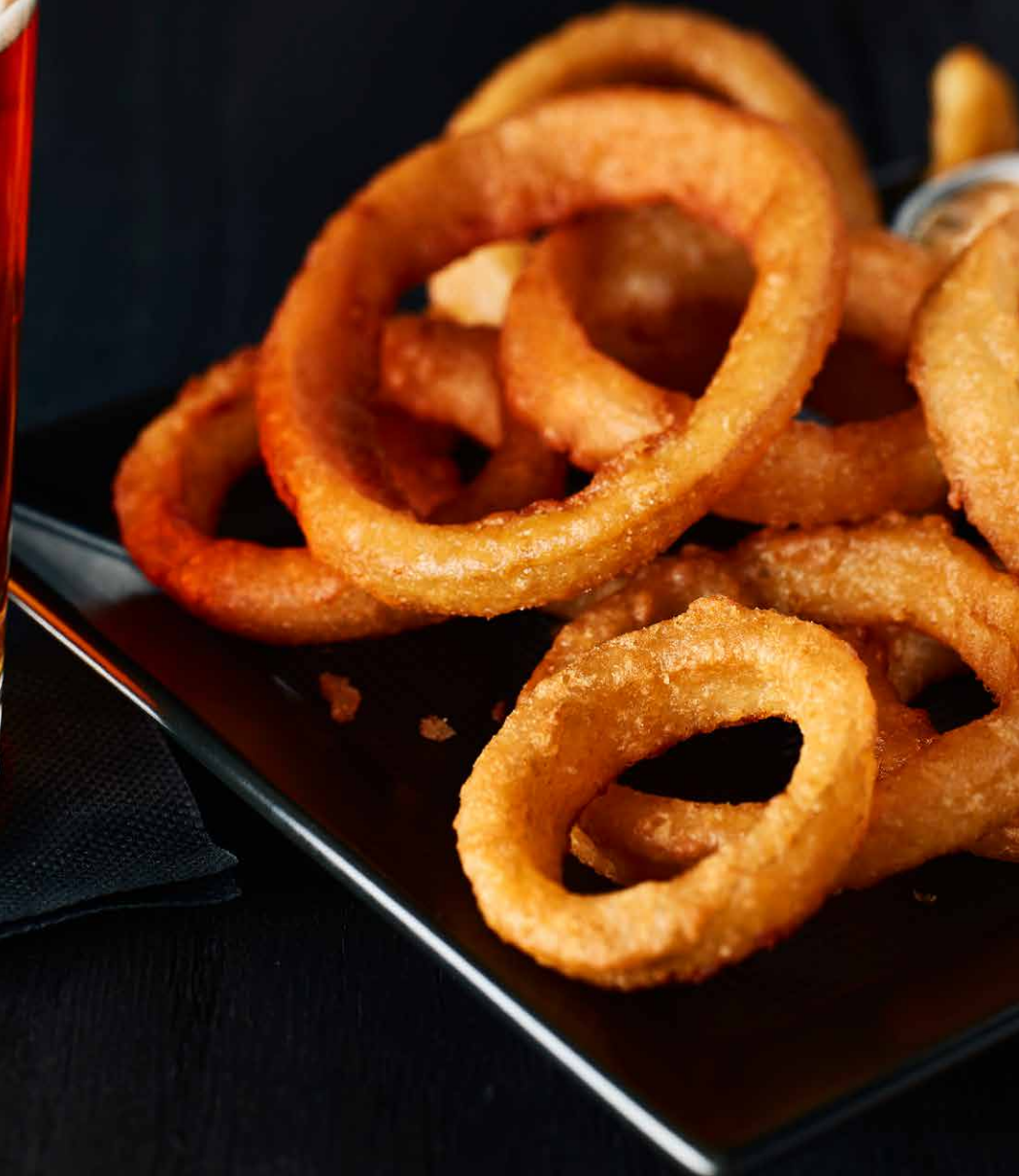
Brew City® IPA Beer Battered Onion Rings (1000005935)