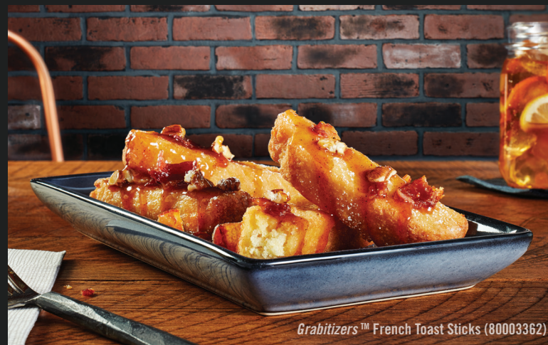
Grabitizers™ French Toast Sticks (80003362)