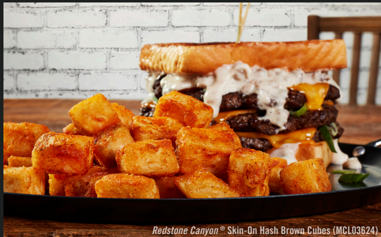
Redstone Canyon® Skin-On Hash Brown Cubes (MCL03624)

The rise of all-day breakfast opens up a vast array of menuing opportunities. With just a few key ingredients, you can drive traffic and boost sales with items customers will return for again and again.