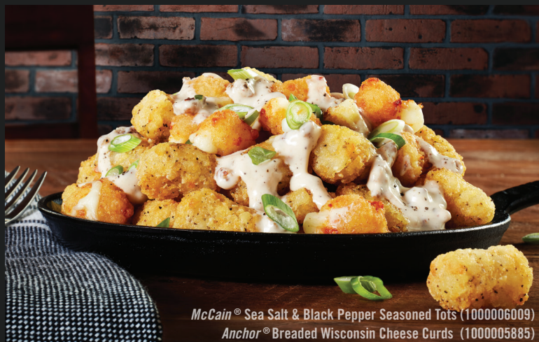
McCain® Sea Salt & Black Pepper Seasoned Tots (1000006009) Anchor® Breaded Wisconsin Cheese Curds (1000005885)