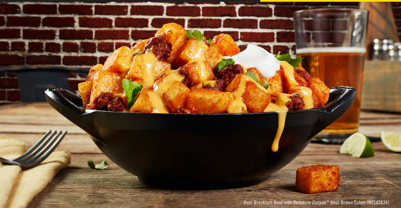
Mexi-Breakfast Bowl with Redstone Canyon® Hash Brown Cubes (MCL03624)

As breakfast traffic continues to grow over every other daypart, get your share of the revenue by offering all-day breakfast. Use this guide to help prepare your menu, marketing and operations for success.