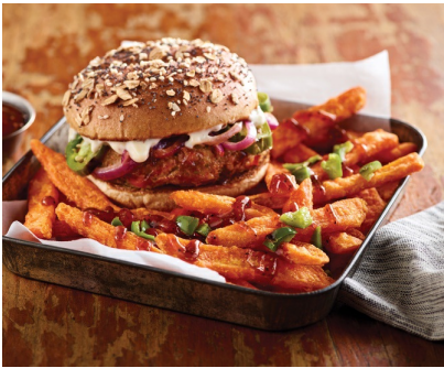
BBQ Veggie Burger with Sweet Potato Fries