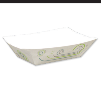
IMT172 / McCain Paper French Fry Holder (sleeve of 100)