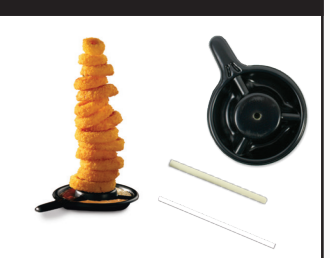
TRAY | TBL149B / 30 Points 6" STICK | TBL151 / 10 Points 12" STICK | TBL150 / 10 Points