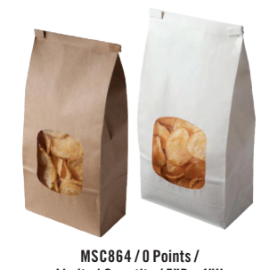
Limited Quantity / 5"D x 4"H