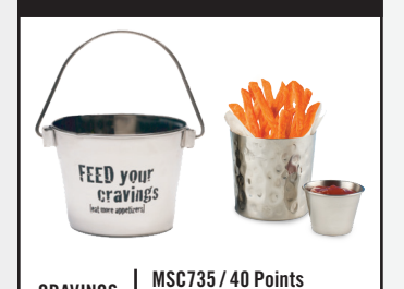
CRAVINGS Limited Quantity / 5"D x 4"H FFHM37 / Stainless Steel / HAMMERED 3.25"W x 3"H