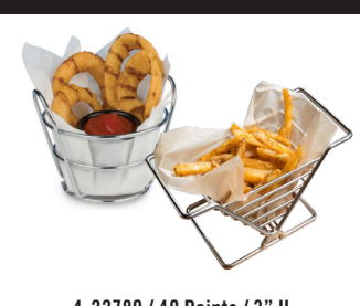
4-22780 / 40 Points / 3" H SRV105 / V-Shaped Stainless Steel Fry