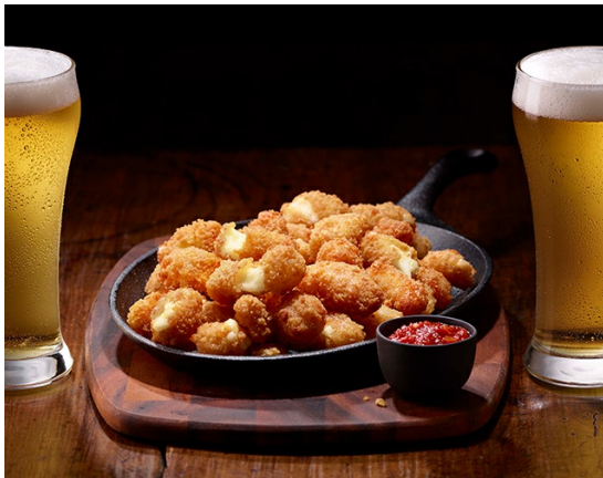
Dips Ahoy! Fire Roasted Pepper Ketchup