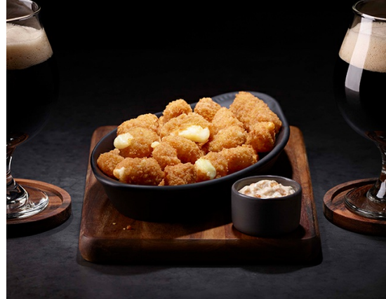
Dips Ahoy! Grilled Onion, Horseradish Sauce