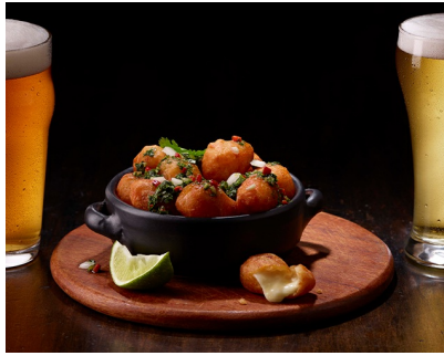
Chimi Gouda Mozz