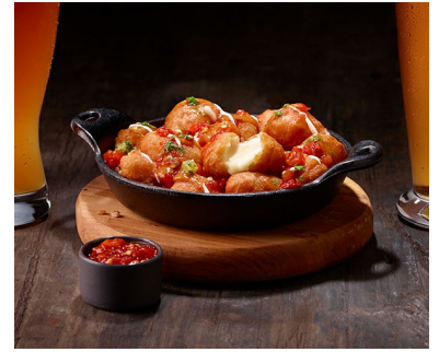
Butter Chicken and Beer Bites