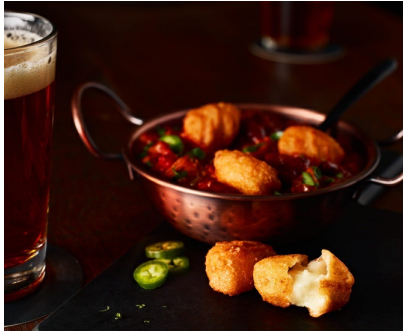
Chili Con Carne