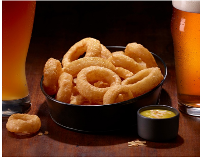
Beer Battered Rings with Kaya