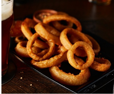
IPA Ring Toss