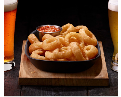
Beer Battered Rings with Kimchi