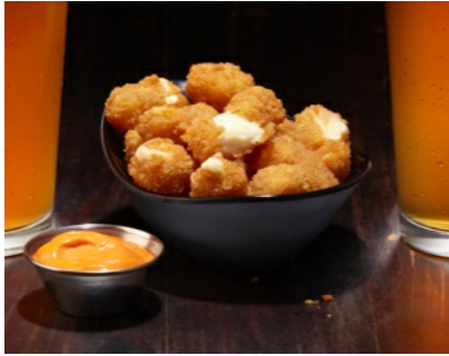
Dips: Gochujang Mayo