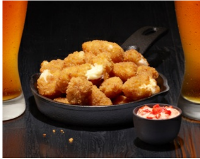
Dips: Peppadew Mayo