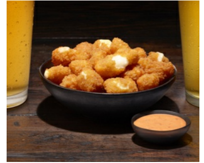
Dips: Chipotle Aioli