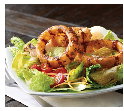
Irish Chicken Salad