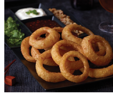
Far East Onion Rings