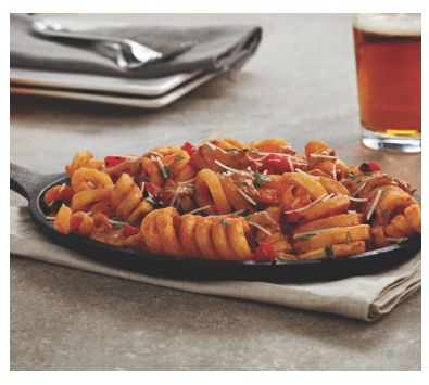
Zesty Chorizo and Alfredo Loaded