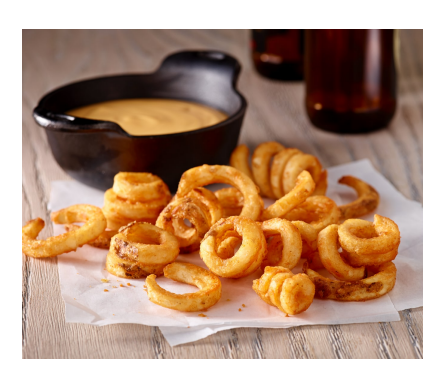
Beer Cheese Spirals