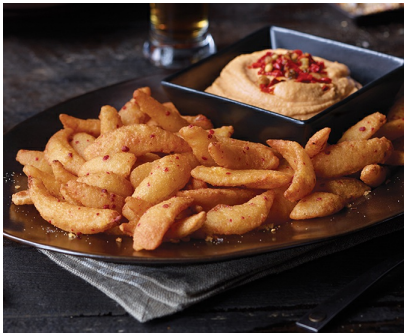
Moroccan Onion Scoops