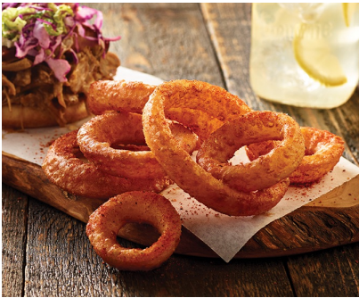
Smoke Rings with a Carolina-style Pulled Pork Sandwich