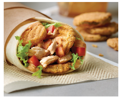
Pickled Chicken Wrap