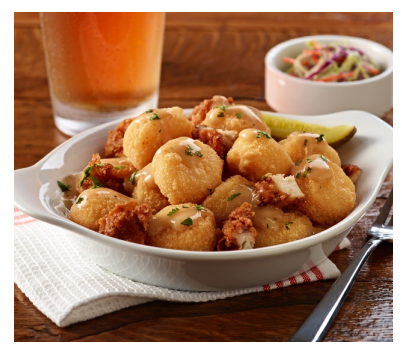
Chicken Fried Potato Bites