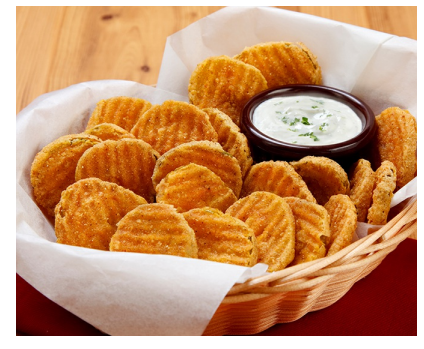
Pickle Chips & Dips