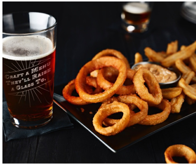
The Obvious Choice