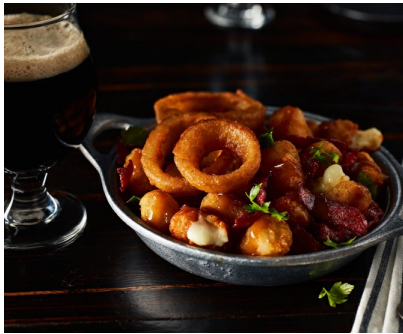
Dublin-er Tots Poutine