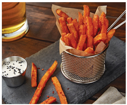
Sriracha-Dusted Sweet Fries