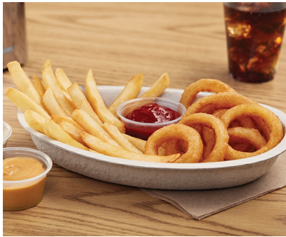
Half and Half