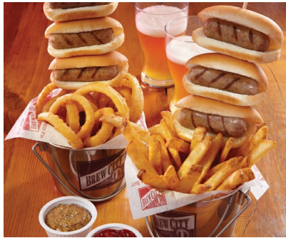
Bucket of Brats