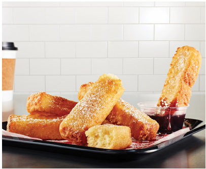
French Toast Sticks with Blueberry Maple Syrup