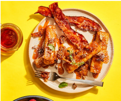
Pecan-Bacon French Toast