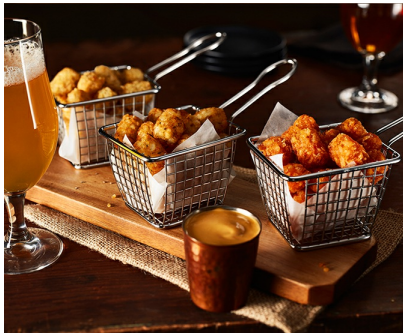
Seasoned Tots Trio