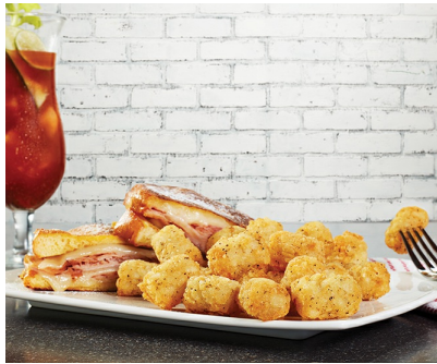
Seasoned Tots with Monte Cristo