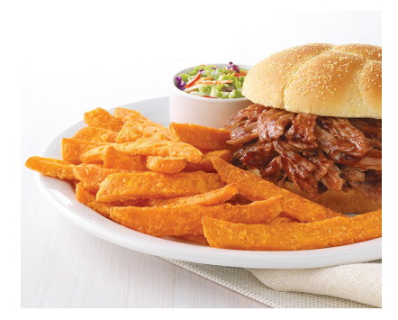
Sweet & Saucy